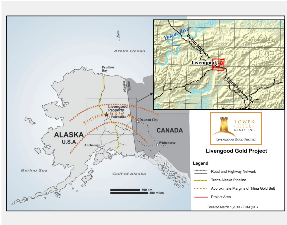
Figure 1: Location of the Livengood Gold Project